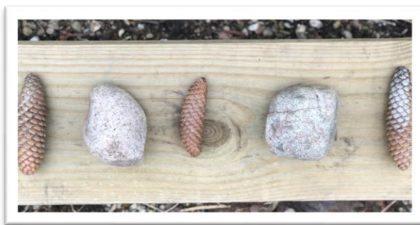
A B A B A pattern

Use materials from nature to copy and make pattern chains. Here are some examples: