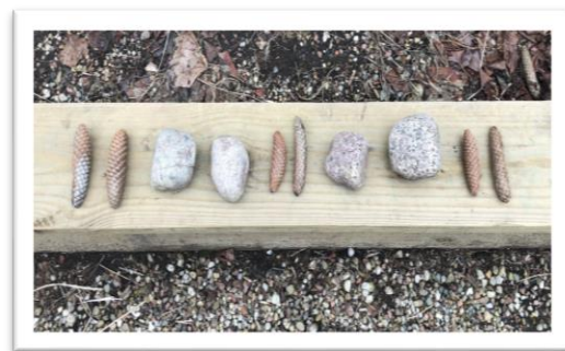
AA BB AA BB AA pattern

Did you know that mourning doves, cardinals, and chickadees have recognizable patterns in their seasonal calls?